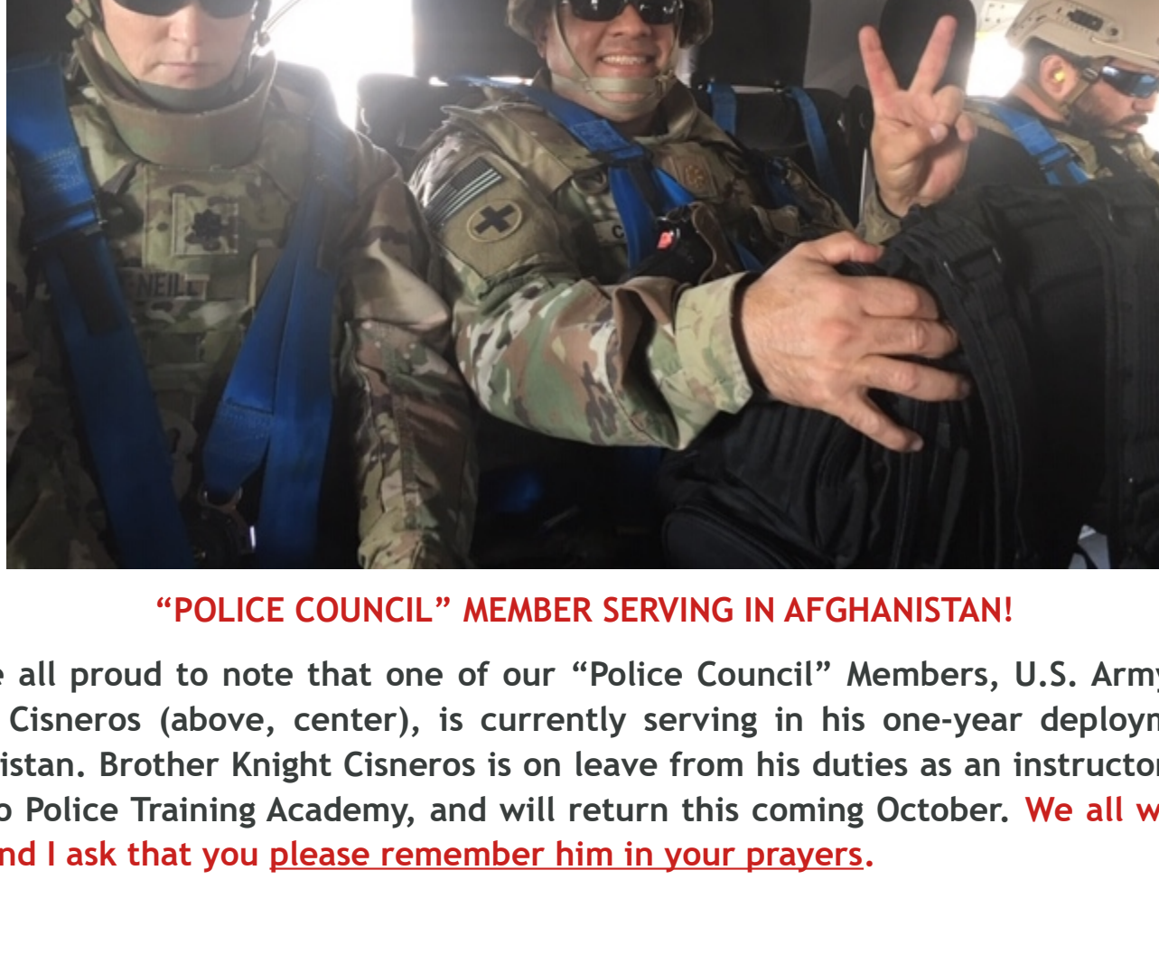
“POLICE COUNCIL” MEMBER SERVING IN AFGHANISTAN!

As is the case when attending any of our meetings or other Knights of Columbus event, please remember to bring your current “Police Council” membership card. Bring your Card....and we will laminate it for you!